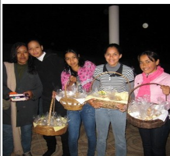
Hundreds of home baked cookies to give to the children in the favelas.

The church that we formed at the A.M.O. Campus is a mission-minded one. Church members pray for and help minister to those less fortunate living in the favelas (slums). Many of them accompany us on weekly mission trips and help alongside our leaders in evangelism, teaching children's classes, visitation, leading Arts/crafts classes and delivering