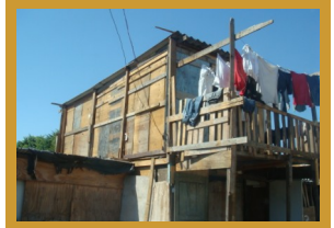
As we get more known in this favela we'll be able to take better pictures!

We have begun to make contacts in two very poor favelas in São Paulo. One is known as Agua Branca (White water) which has a river running through it that looks like tar! The other is called Moinho (Windmill). Both of these favelas are made up of wooden huts and the residents are very poor. Please pray for our safety as we enter in these dangerous areas and for wisdom as we start