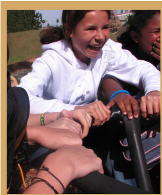
Taking pictures of the kids on the rides proved to be more difficult than ever!

As a part of our Embrace-a-Child program we were able to load up our big bus full of young teens and treat them to a day at the theme park, Hopi Hari. Sponsors from FBC, Smyrna provided the funding for these kids to enjoy a full day of tons of rides, shows, and even a large goodie bag for each one filled with lunch material and loads of extra treats. The kids had a great time and made lots of memories! (I'm sure they'll never forget the long lines!) Our two summer students arrived just days before the event so they were able to help chaperone. The kids were amazing and we're thankful that they behaved so well. At the end of the day I don't know who was more exhausted the kids or our team!