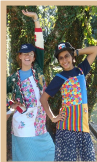
One of their craziest moments!